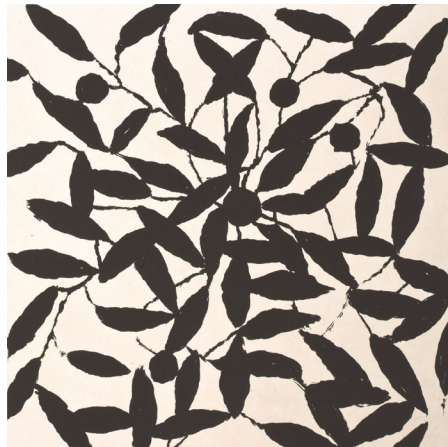
(bottom right) Beginners , 2007 Sugarlift aquatint etching with chine colle; Paper size: 29" x 28"; Edition of 35

I am starting from that vantage point, and want to see if I can possibly do that with prints and see whether they coordinate with some ideas that I had for the new paintings.