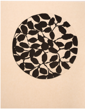
(top left) Sky on Head, 2007 Sugarlift aquatint etching with chine colle; Paper size: 29" x 24"; Edition of 50