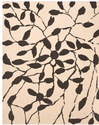
(top right) At Present, 2007 Sugarlift aquatint etching with chine colle; Paper size: 29" x 24"; Edition of 50