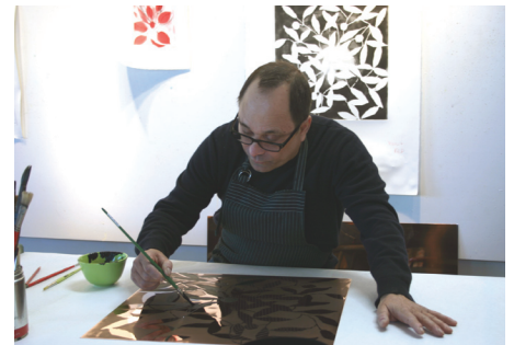
Ross Bleckner in the Paulson Press Studio.

Ross Bleckner was born in New York in 1949 and grew up on Long Island. After attending the California Institute of the Arts (CalArts) in Valencia, CA, he returned to New York and became one of the first artists to join the Mary Boone Gallery, where he continues to exhibit today. Since that time, his work has been exhibited in major group and solo exhibitions at museums throughout the world, including the San Francisco Museum of Modern Art, the Whitney Museum of American Art, the Institute of Contemporary Art, Boston, the Museum of Contemporary Art, Los Angeles, and the Berkeley Art Museum. In 1995, a mid-career retrospective was held at the Solomon R. Guggenheim Museum in New York. ✨