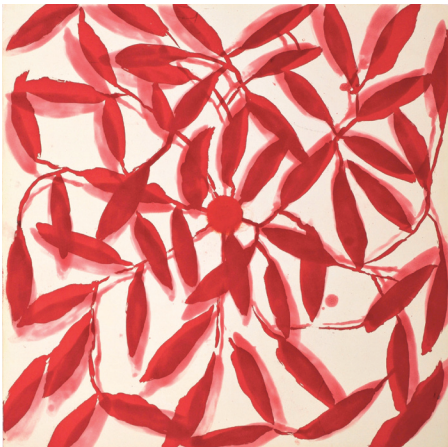
(bottom left) Beginners & Others , 2007 Color sugarlift aquatint, spitbite aquatint and aquatint etching; Paper size: 29" x 28"; Edition of 35