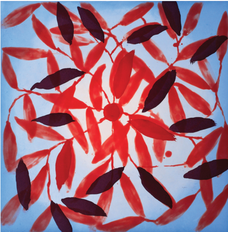
(left) Bonfire , 2007

A: The structure of the image: the leaves, starting out from the center, and the rotating leaves in different configurations. They are all very layered; I'm trying to get this kind of shadowy quality of light.