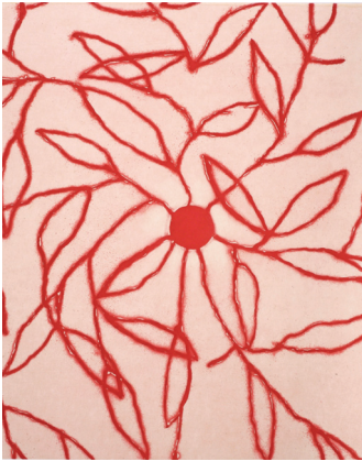
(bottom right) Early Every Evening, 2007 Sugarlift aquatint and flatbite etching with chine colle; Paper size: 29" x 24"; Edition of 20