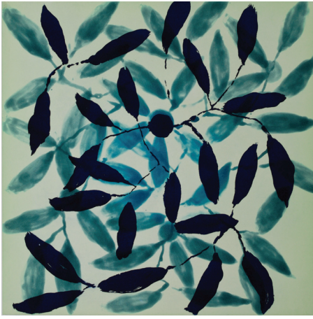
(top left) Swinging Blue Door , 2007 Color sugarlift aquatint and spitbite aquatint etching; Paper size: 29" x 28"; Edition of 35